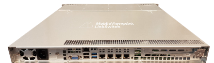
1U Linkswitch Server - for IP playout with transcoding option