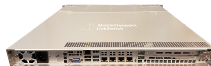
1U Linkswitch Server - for IP playout with transcoding option